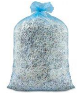
Shredded Paper in clear bags